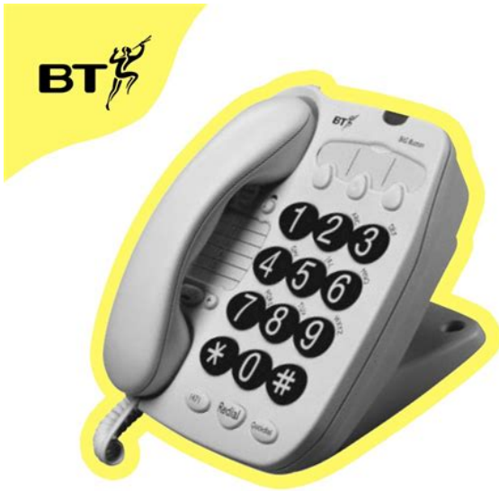
BIG Button phone